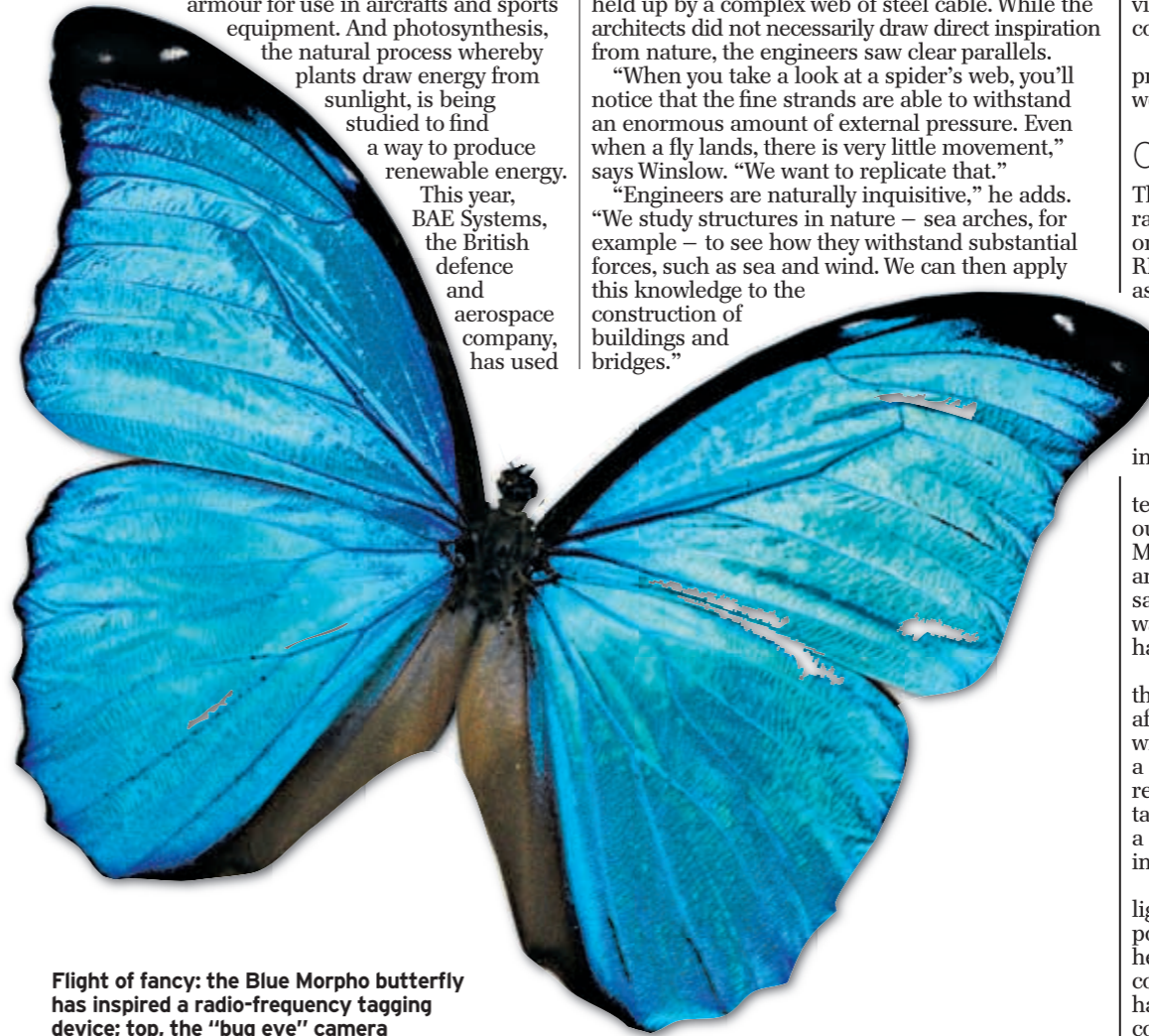
Flight of fancy: the Blue Morpho butterfly has inspired a radio-frequency tagging device; top, the "bug eye" camera

Elsewhere, the shell of a deep-sea snail is providing inspiration to develop toughened armour for use in aircrafts and sports equipment. And photosynthesis, the natural process whereby plants draw energy from sunlight, is being studied to find