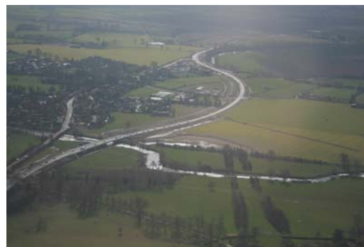
Figure 1: Road alignment as seen on a map Figure 2 Road alignment as seen from the air